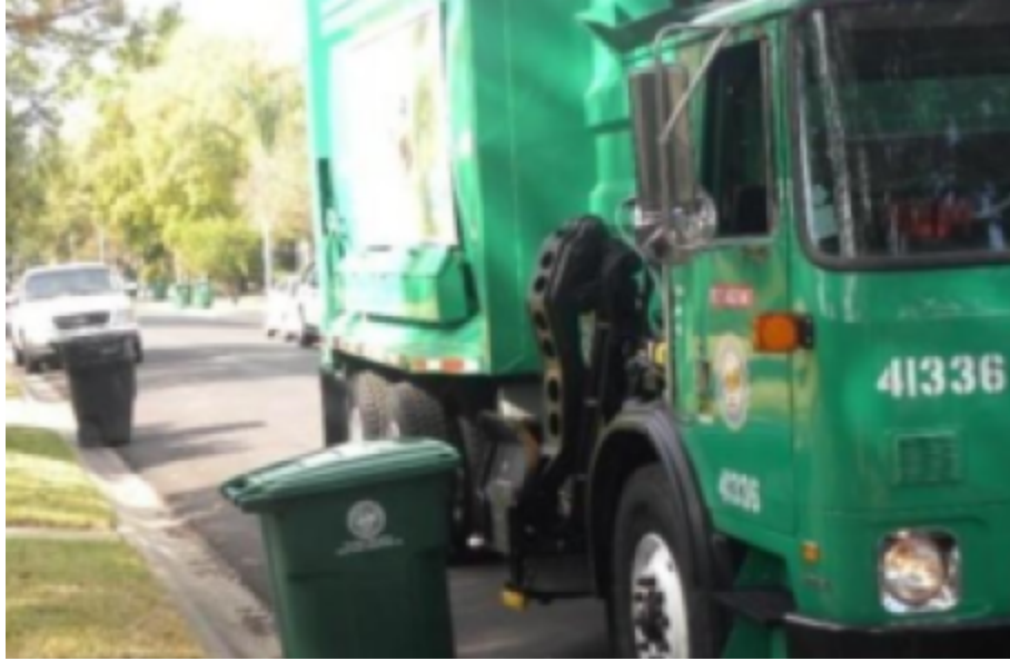
Garbage/Recycle Collection Days