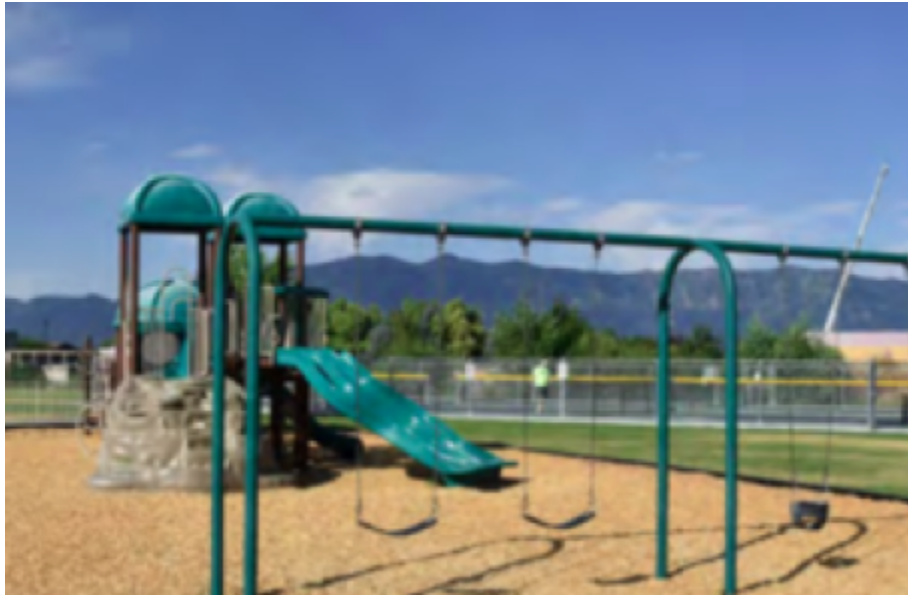
Parks and Trails