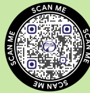
Car Show Info