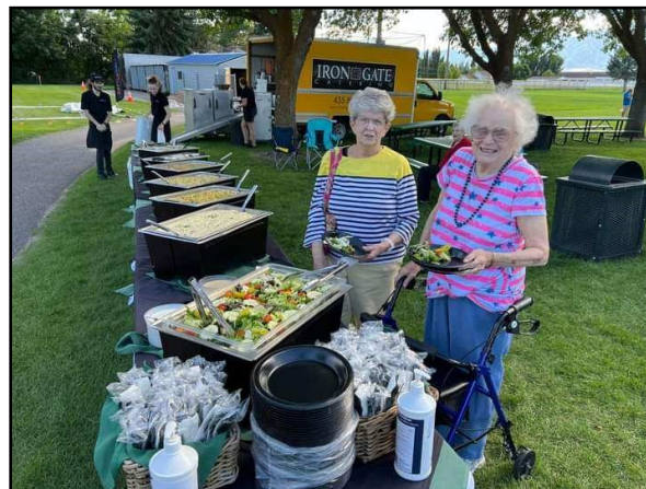
Traditional Turkey & Sauerkraut Dinner

Thanks for an amazing week! More photos and a video recap of the week's events are posted on the Providence City social media pages and the city website.