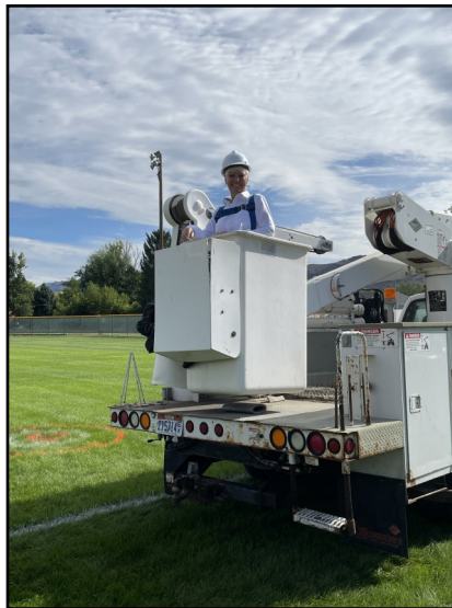
Mayor Alder Prepares to Drop Ping Pong Balls